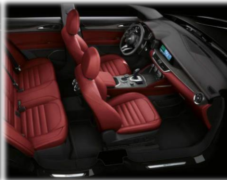
Red w/ Silverwood inserts