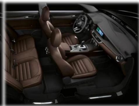
Brown w/ Silverwood / Walnut inserts