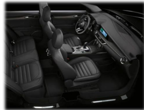
Black w/ Silverwood / Walnut inserts

Leather upholstery available in 3 colour choices and featuring colour coordinated instrument panel underside, centre armrest & door panels inserts.