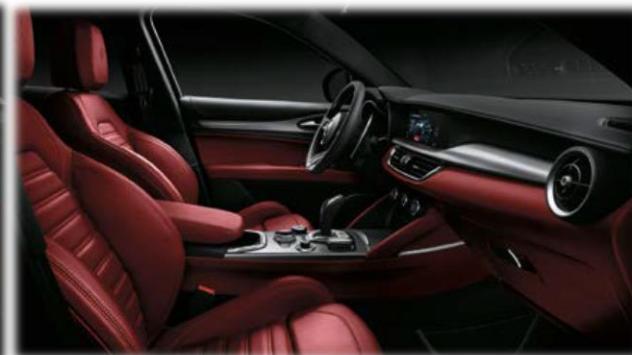
Red sports leather