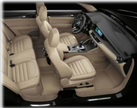
Beige w/ Silverwood / Walnut inserts