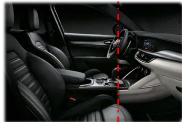
Black sports leather | White interior

Veloce sports leather upholstery with perforated leather inserts, colour coordinated instrument panel underside, centre armrest & door panel inserts.