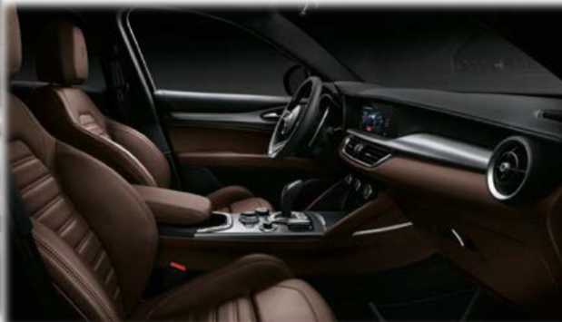
Mocha sports leather